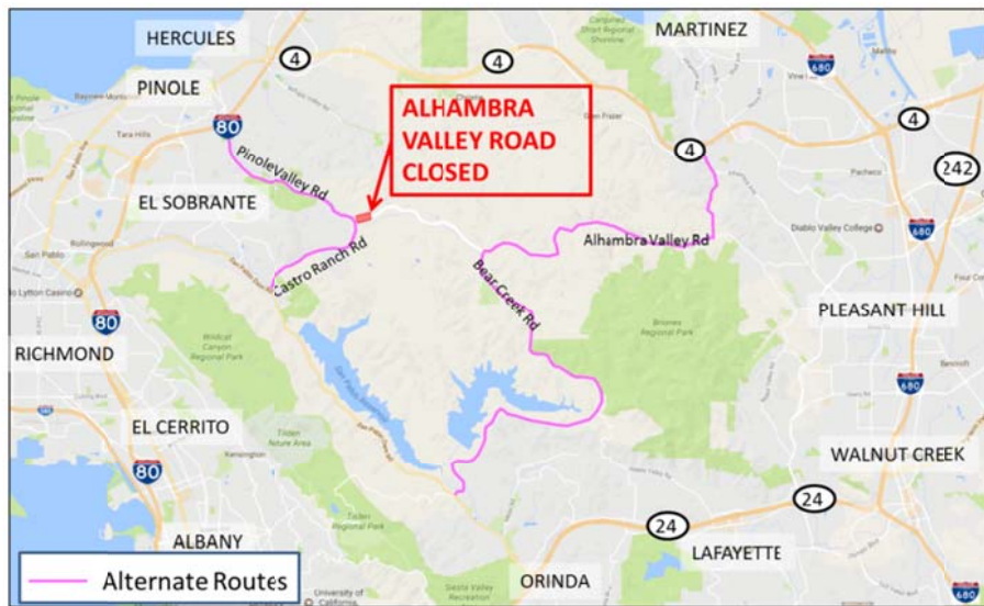
Alternate routes for closure of Alhambra Valley Road