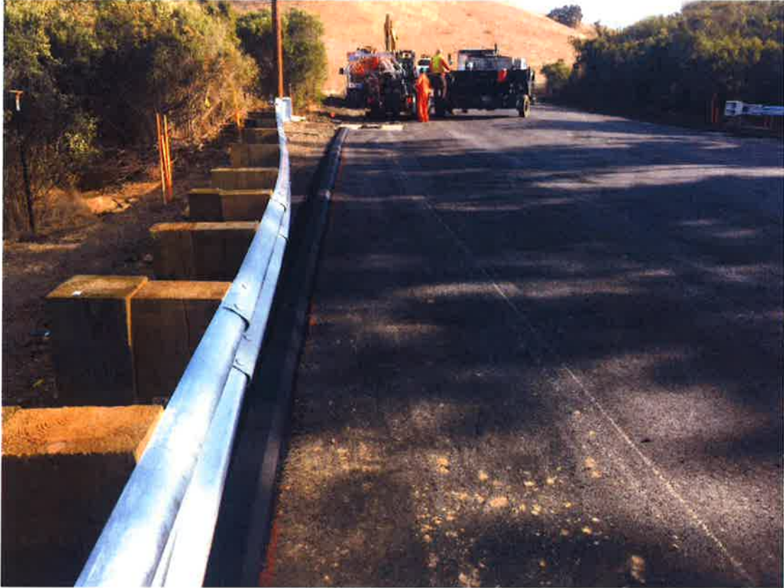
HMA Dike being installed.