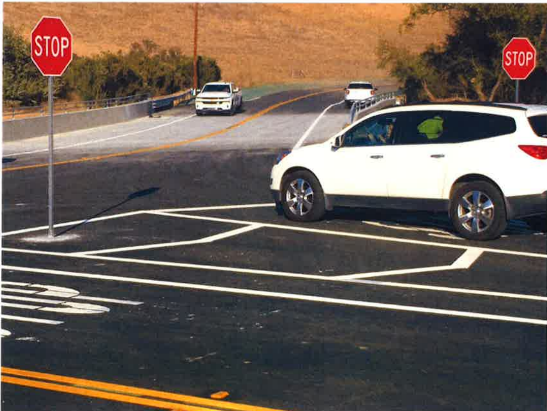
Project Complete! Road open 11/02/2017.