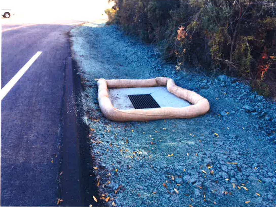
Erosion control placed and fiber rolls around drainage inlets.