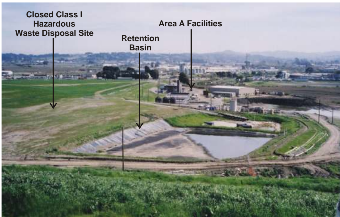
Figure 6-3 Retention Basin. This retention basin receives storm water runoff from the closed Class I hazardous waste disposal site and the composting area.